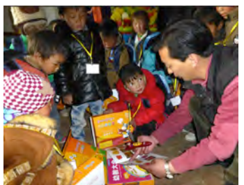
Fondazione Amici di Qinghai Y Swiss Friends of Qinghai