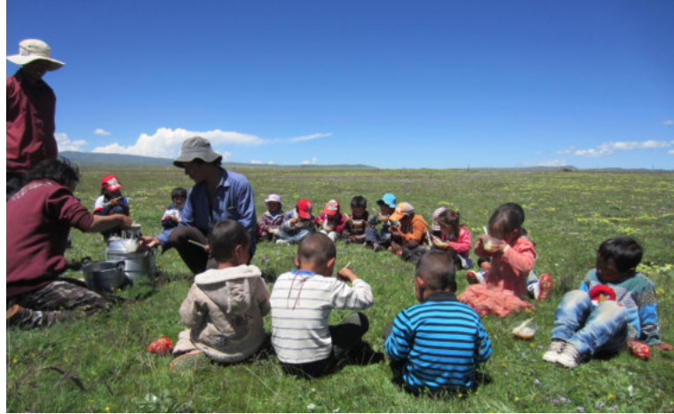
Temperatures remain below minus 10° to15°C for four months